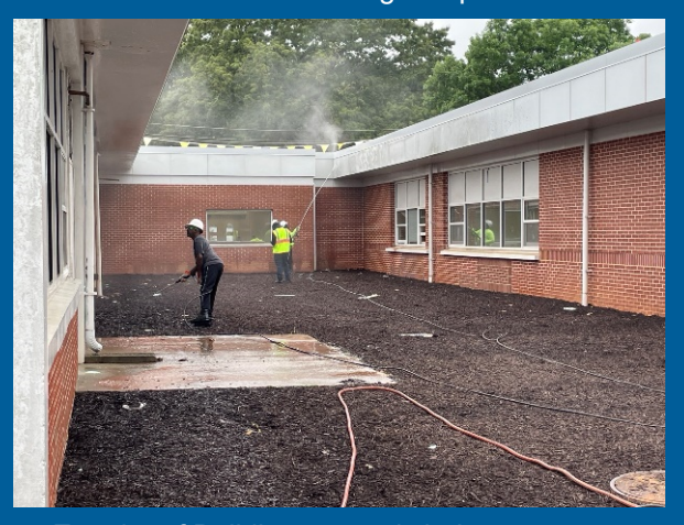
Exterior of Building currently being pressure washed