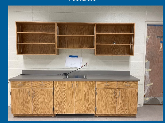
New Casework/Cabinets installed in classrooms