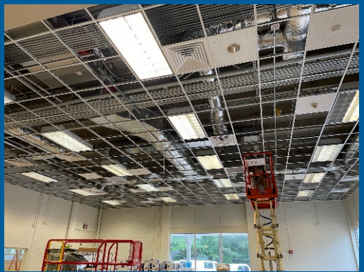
Ceiling Grid and Tile install in Cafeteria Area