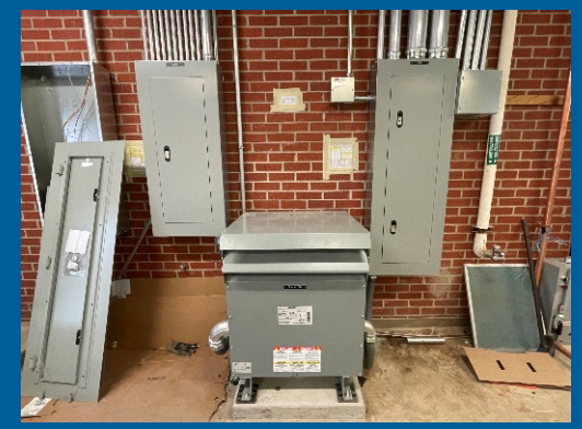
New transformer and switchboards installed