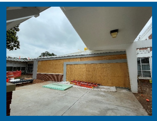
Air Barrier applied on exterior of security vestibule